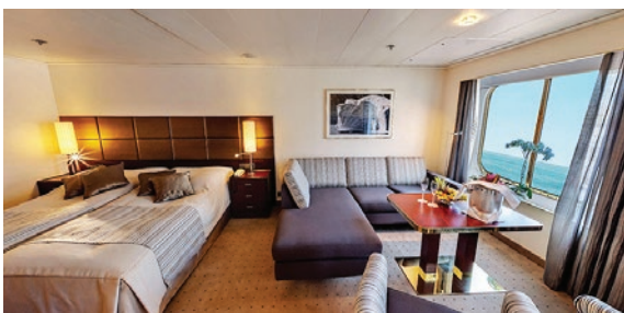
DECK 6 | HERITAGE SUITES SIZE: 44m 2 (475.SqFt)