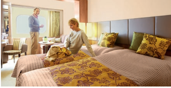
DECK 5 | SUPERIOR CABINS SIZE: 22m 2 (235.SqFt)

Superior Cabins on Deck 5 are a spacious 22m 2 and feature large panoramic windows, king or two single beds, lounge area, writing desk, private en-suite bathroom with shower, ample storage and a flat screen entertainment system.