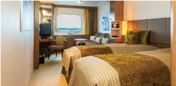
DECK 5 | SUPERIOR SINGLE CABINS SIZE: 22m 2 (235.SqFt)

Superior Single Cabins on Deck 5 are a spacious 22m 2 and feature large panoramic windows, king bed, lounge area, writing desk, private en-suite bathroom with shower, ample storage and a flat screen entertainment system.