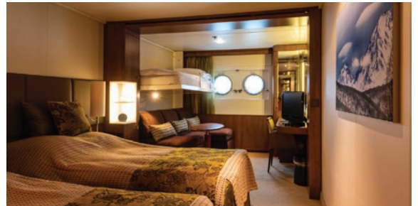
DECK 3 | MAIN DECK TRIPLE CABINS SIZE: 22m 2 (235.SqFt)

Superior Triple Cabins on Deck 5 are a spacious 22m 2 and feature large panoramic windows, two single beds and one Pullman bed which folds down from the wall, lounge area, writing desk, private en-suite bathroom with shower, ample storage and a flat screen entertainment system.