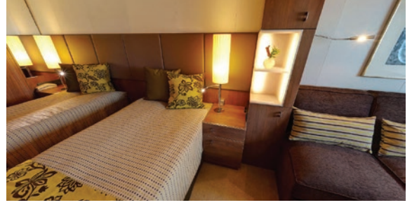
DECK 4 | SUPERIOR CABINS SIZE: 22m 2 (235.SqFt)

Superior Cabins on Deck 5 are a spacious 22m 2 and feature large panoramic windows, king or two single beds, lounge area, writing desk, private en-suite bathroom with shower, ample storage and a flat screen entertainment system.