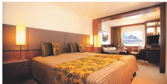
DECK 6 | WORSLEY SUITES SIZE: 22m 2 (235.SqFt)

Located on Deck 6, Heritage Suites are an expansive 44m 2 and feature large double panoramic windows, king bed, large living area with a sofa, coffee table and chairs, large writing desk and grand marble bathroom with a double basin, bathtub and shower, floor to ceiling storage and a flat screen entertainment system.