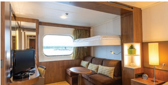
DECK 5 | SUPERIOR TRIPLE CABINS SIZE: 22m 2 (235.SqFt)

Superior Triple Cabins on Deck 5 are a spacious 22m 2 and feature large panoramic windows, two single beds and one Pullman bed which folds down from the wall, lounge area, writing desk, private en-suite bathroom with shower, ample storage and a flat screen entertainment system.