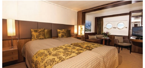
DECK 3 | MAIN DECK SINGLE CABINS SIZE: 22m 2 (235.SqFt)

Superior Single Cabins on Deck 5 are a spacious 22m 2 and feature large panoramic windows, king bed, lounge area, writing desk, private en-suite bathroom with shower, ample storage and a flat screen entertainment system.